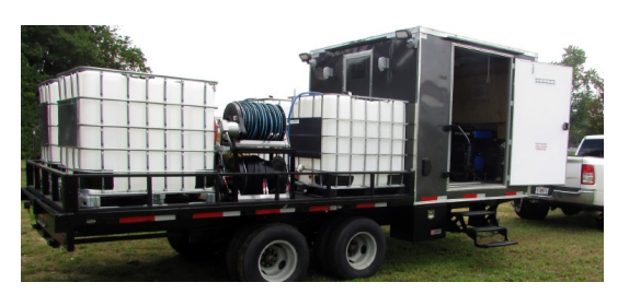
SoiLok® Professional rig