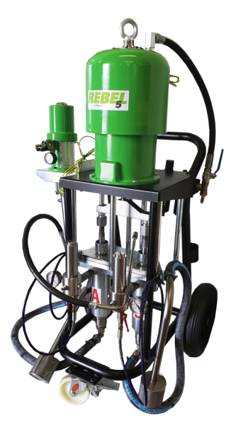
Rehel 5 model

The Rebel (available in Rebel 2 and Rebel 5) is for pumping single-component or 1:1 ratio (2 component) materials, including SoiLok acrylates and some polyurethanes. The Rebel is a powerful yet simple air-operated, stainless steel unit featuring consistent air pressure with instantaneous reversing, delivering uniform fluid/mixing pressure. This pump operates from a separate air source. It includes three 25 ft dispense hoses (material 'A', material 'B' and flush.) Can be used to pump SoiLok, Precision Fill, Joint Shield 5500, Prime Flex 985 LX10 & LX20. Works with the FlowMaster pistol, FlowMaster wand, SoiLok gun and Equalizer gun (see Equalizer on page 13).