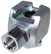
1. IL 1/2" & SG 3/4" Fitting - buttonhead coupler Item #11981