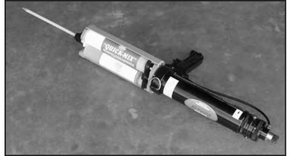
"Quick Mix" 1:1 Pneumatic Gun