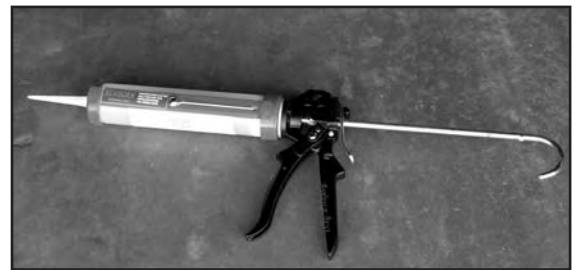
"Single Shot" Manual Gun