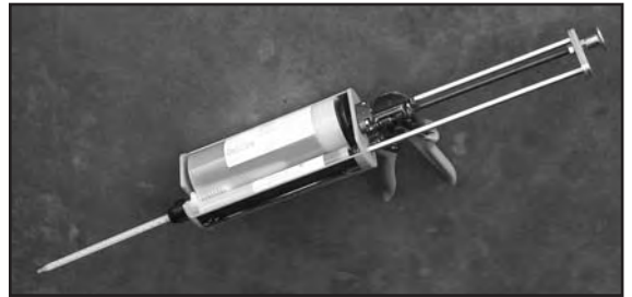
"Quick Mix" 10:1 Manual Gun