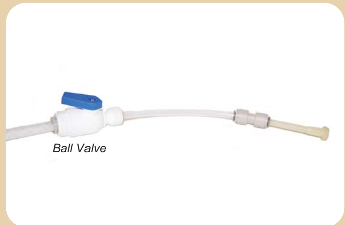
Quick Mix Reducer Ball Valve