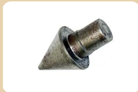
Expendable Drive Point

Our drive point is used in conjunction with 3/4" pipes. The drive point provides a pointed end to help the pipe penetrate the ground and to keep soil and debris out of the pipe. Once the pipe is in place, it can be raised a few inches to drop the expendable drive point and allow the chemical grout to flow freely. Item #DP-34