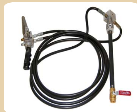
Probe Grouting Gun & Pipe Adaptor