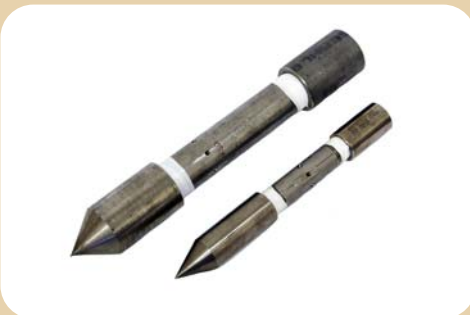
3/8" & 3/4" Soil Probes