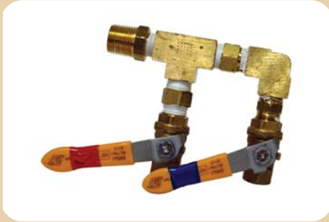
Brass "F" Valve