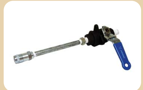
High Pressure Flow Control Valve

This is the only accessory required to turn an airless sprayer into an injection pump. It allows the operator control of resin flow at the point of injection. High pressure valve. Up to 4,500psi. Item #685-H