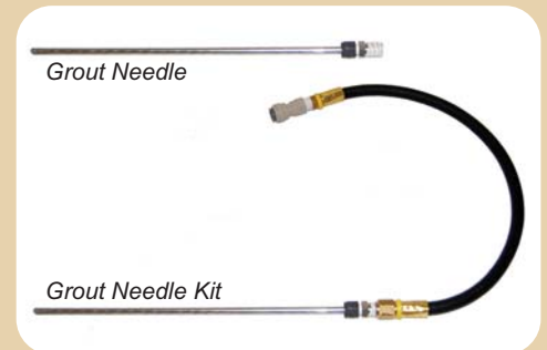
Grout Needle & Kit

This 1/4" stainless steel grout needle is 12" long. Use it to penetrate rubber boots for leak sealing at the manhole-pipe connection. It is also good for injecting Prime Flex polyurethane behind an activated oakum seal. We also offer a model that attaches directly to the mix nozzle of our "Quick Mix" and Single Shot cartridges. Custom lengths available upon request. Needle - Item #674, "Quick Mix" Kit - Item #675