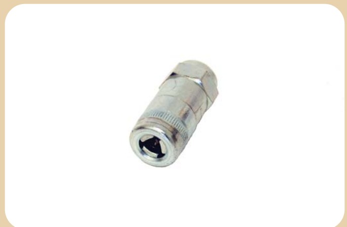
High Pressure Coupler