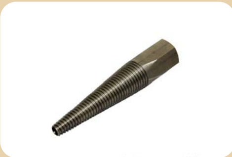
Wall Stinger Nozzle

This low cost valve assembly was designed to "twin stream" Prime Flex polyurethanes with water. The mix ratio is controlled by the operator using the two on/off valves that come with the assembly. This is especially useful for injecting Hydro Gel into leaking manholes. Low pressure valve. 600psi and under. Use with grout needle kit or wall stinger nozzle. Item #F-VALVE